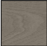
Ash wood tobacco